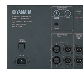
MSR800W Rear Panel

All-in-one sound solutions that are powerful, versatile, and reliable.